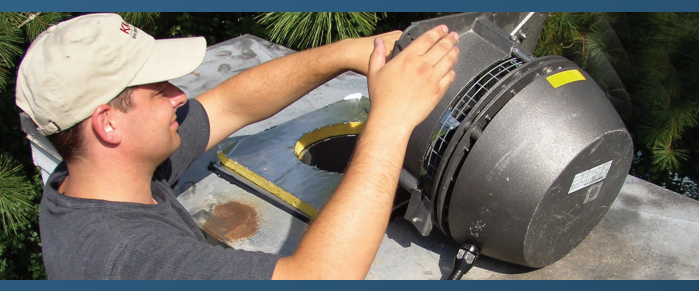
Installing the fan on top of the chimney is fast and easy.

You will most likely experience the same problems you had before the chimney fan was installed.