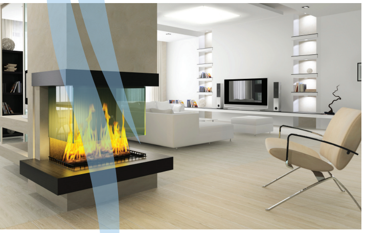
Whether your fireplace is old or new, the ENERVEX Chimney Fan System is right for you.

The ENERVEX Chimney Fan System provides a reliable draft in your chimney—all the time. And you'll never even notice that it's there.