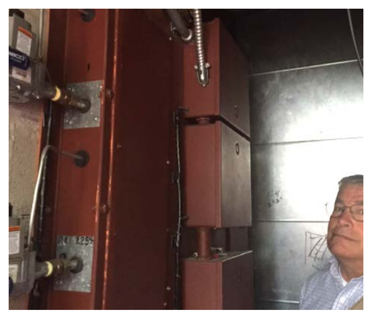
A view of the hardware in back of the fireplace

USC now has an attractive and efficient fireplace that carries on the prestigious legacy envisioned by the institution's founders when it opened in 1880. In addition, the risk for safety problems and project delays is significantly lower due to the design's UL Listed parts with built-in safety for both proof of chimney draft and air supply conditions.