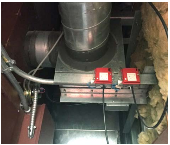
The inside of the fireplace