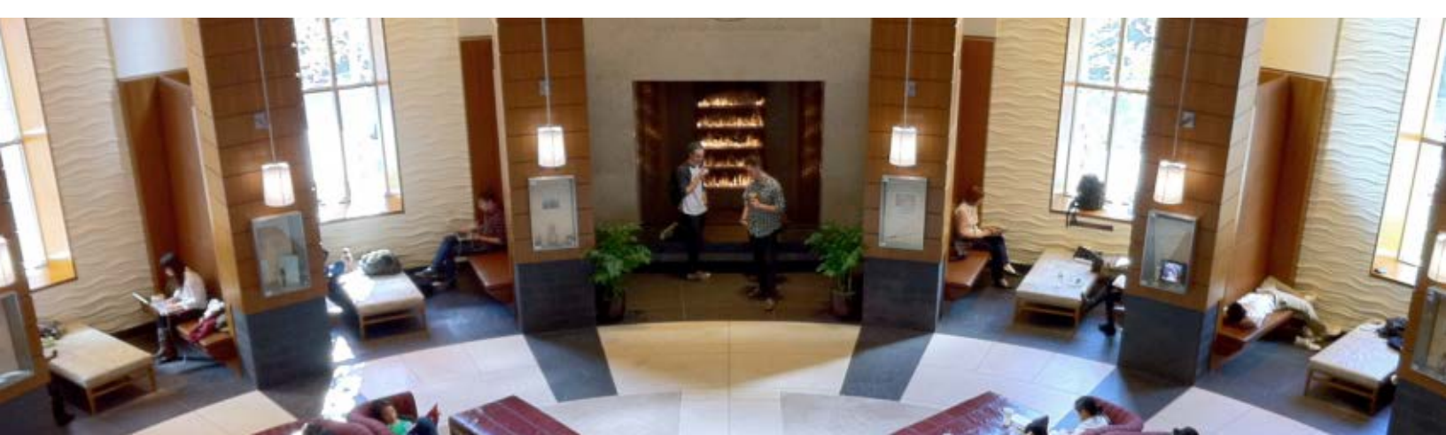
The vertical-flame fireplace in the Ronald Tutor Campus Center

The vertical-flame fireplace design entails a series of five drilled burner lances stacked approximately 12" apart. Each lance