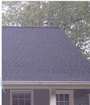
A discreet termination