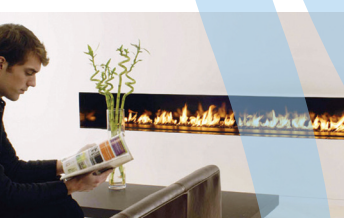
Any fireplace design works with IntelliDraft