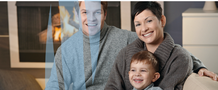
Enjoy the convenience and safety of an IntelliDraft solution

Maintaining a proper and safe draft condition for the fireplace and the room providing it air for combustion are big challenges in today's tight construction. IntelliDraft is designed specifically to meet these needs.