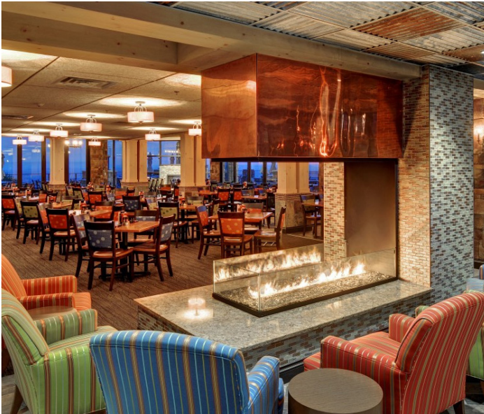
The custom three-sided, gas peninsula open fireplace