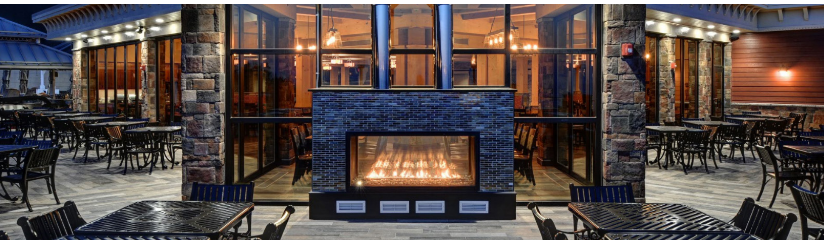
The custom indoor/outdoor glassed-in fireplace

This high-quality custom gas fireplace solution generates increased revenue opportunities for the ski resort by creating an inviting dining space no matter what time of year. The chimney and fan products offer clean and easy installation,